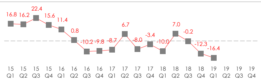
FIGURE 2 R3 will now report on Business Confidence as published by ICAEW. This continues to decline and at -16.4 is at its lowest in a decade.

Brexit uncertainties have certainly contributed to this, in particular in the last quarter, together with poor retail results at the end of 2018 and a decline in momentum in China and some Eurozone countries.